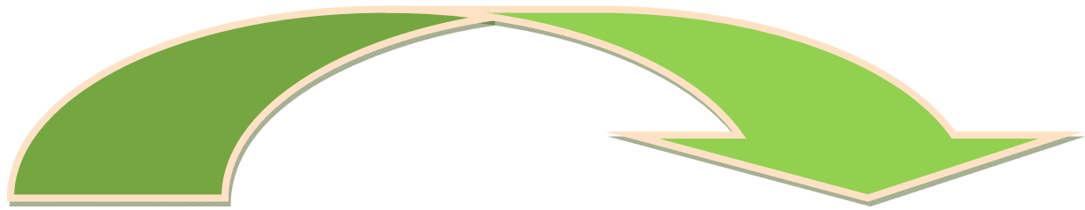
EXHIBIT HALL SPECS AND LAYOUT

CARIBBEAN EXHIBIT HALL (3 & 4) DIMENSIONS: 10,000 square feet of beautifully carpeted exhibit space. The Exhibit Hall is located in the very center of Conference Programming.